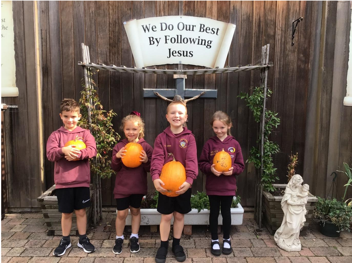
St Ambrose Gardening Club showcasing their home grown produce.