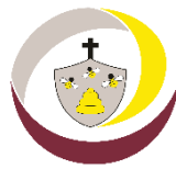
St Ambrose Catholic Primary School